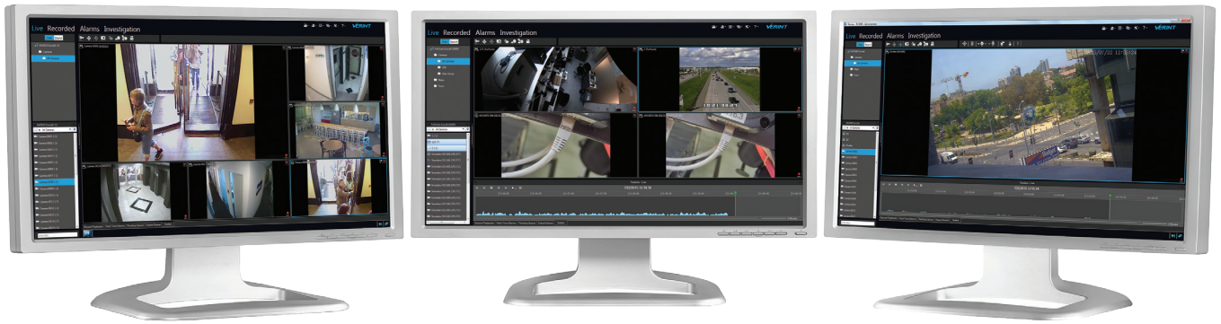
An enterprise solution connecting hundreds of users and thousands of devices

VMS Virtual Matrix™ enables cross-site network-based distribution of live and recorded video, audio, and alarms to video walls, analog monitors and HD monitors. Effective Video Routing with VMS Virtual Matrix. Easily distribute video locally, across dispersed locations or to a centralized Command, Control and Communications (C3) environment.